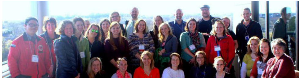
*Employer-hosted site visit, JAMF Software HQ , Eau Claire, WI